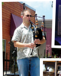
Juice O' the Barley