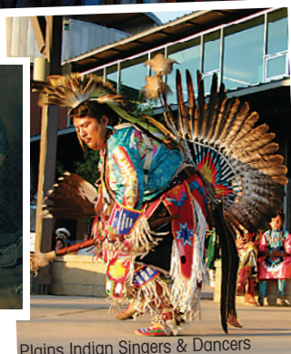
Plains Indian Singers & Dancers