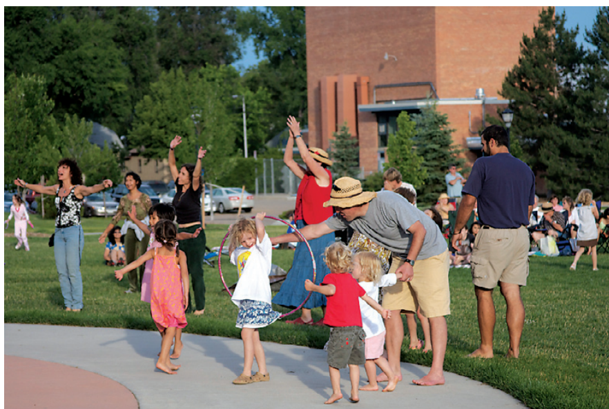
People dancing and having fun at the concerts in the park.

Concert goers, movie fanatics and dancers will be in for a treat this summer with a great lineup of outdoor concerts, movies in the park and street music in Longmont.